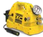
Battery-Powered Torque Wrench Pumps