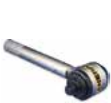
Manual Torque Multipliers