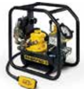
Pneumatic Torque Wrench Pumps