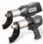
Pneumatic and Electric Torque Wrenches