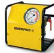
Pneumatic Tensioning Pumps