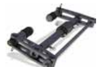
Flange Puller Sets