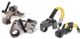
S, W, RSL and DSX-Series Hydraulic Torque Wrenches