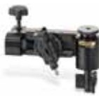
Flange Face Tool