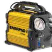
Electric Torque Wrench Pumps