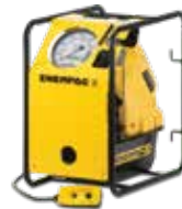
Electric Tensioning Pumps